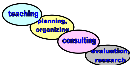
Fig. 2. Competencies for Andragogy students

A first module in this competency is “ Visualising, Presentation, Moderation. ” Here, students learn to stand in front of a group, design presentation material, work with an auditory, present learning material, and interact with groups.