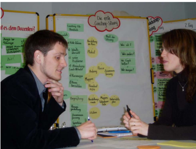
Fig. 4. Mutual planning of subject matter specialist and coach (Andragogue)

beginning semesters. What we changed: We added one class about quantitative and one about qualitative research in the final semesters of the study – the time when students have to prepare their thesis. This relates research work to a “real” research question, to a practical application and performance. To support this competence, we offer a research colloquium where students present and discuss their research work and individual consulting .