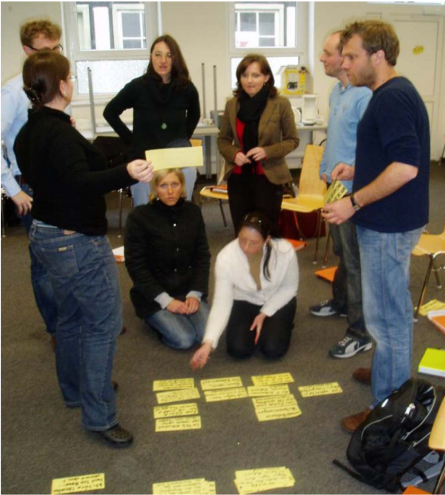
Fig. 3. Group training in moderation techniques